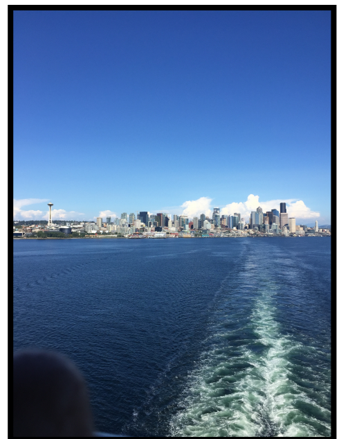
Cruise Ship sailing from Seattle