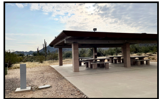
Top - Group Camping Area Lower - Family Camping Area Loop