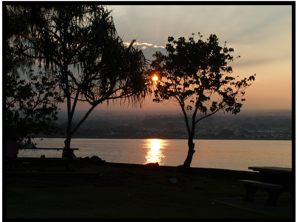
Sunset from Coconut Island looking west at Hilo Bay