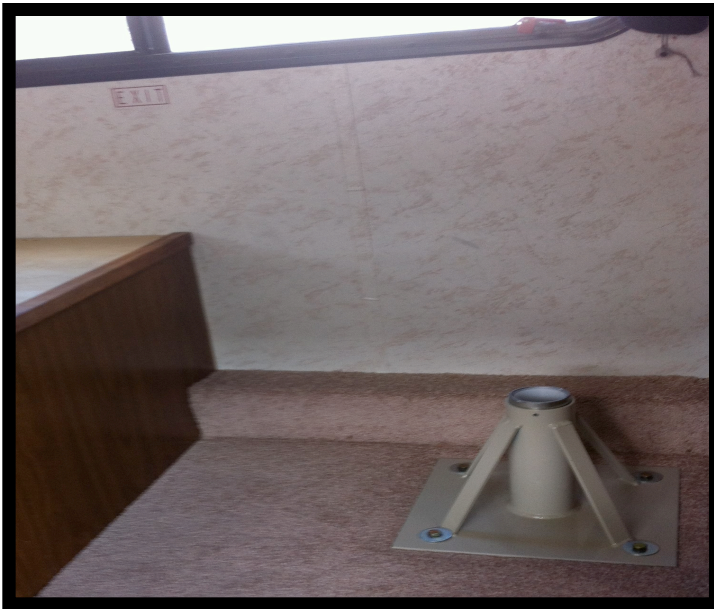
Lift Floor Mount

available, so I bought it. I knew I was going to need a few more modifications, so I had a RV tech lined up to do interior modifications. The first order of business was to gut the bedroom except for one closet, twin bed and upper storage. The bed could not be removed because there was an electric converter under it. I am 6' 7" tall and need a big bed thus the twin was expanded to run the full width of the RV to give me plenty of leg room. The bed is wider to make it a queen size frame. Since my wife is no longer able to transfer me, I had a Hoyer type swimming pool lift mounted on the floor to pick me up from my wheelchair and swing me over to the bed. I used a lift marketed for swimming pools to help keep the cost down. The base of the lift is a surface mount for the pool lift. The frame underneath the floor was beefed up to support the weight of transfers. We also upgraded the TV's to LED flat screens and replaced the old carpet with more durable laminate flooring.