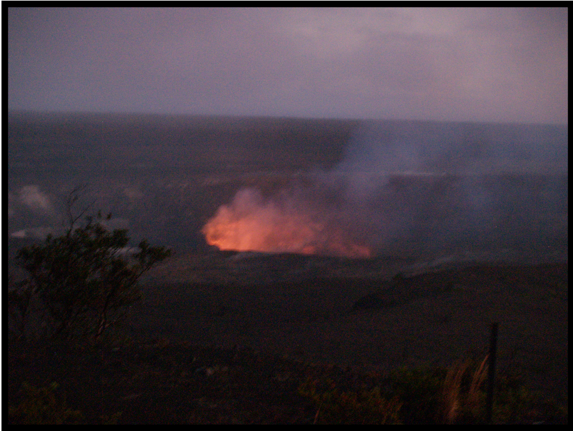
Kiluaea Volcano shortly after Sunset. (That is not just an orange glow from the lava on the

After returning to Phoenix / Mesa we headed east to Sebring, Florida, arriving December 29th. January weather was normal for the most part in the upper 60s but February has been 10-15 degrees above normal. Daytime highs have been 79-85 degrees with lows in the upper 60s. We leave Sebring March 1st with stops at Lady Lake, Florida to visit RV friends and two firefighters I used to work with, Savannah, Georgia with reservations at Paula Deen's Lady and Sons Restaurant, Anderson, South Carolina and, finally, near our 2018 Rally location visiting high school friends in Muncie, Indiana located northeast of Indianapolis. Then its back to the upper-midwest weather in suburban Milwaukee, Wisconsin.